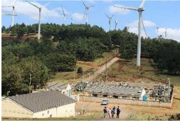
Ngong Hills Site

Most people living in the vicinity of the wind farm say that little, if any, benefit has accrued to them. Residents complain about noise that comes from the turbines, and report that birds regularly fly into the blades at night. The disillusionment that local people feel comes from the fact that they were not consulted about the farm, and they feel they have had no say in its location or operation. In addition, they do not directly benefit as partial owners, while the power that is generated by the farm bypasses them.