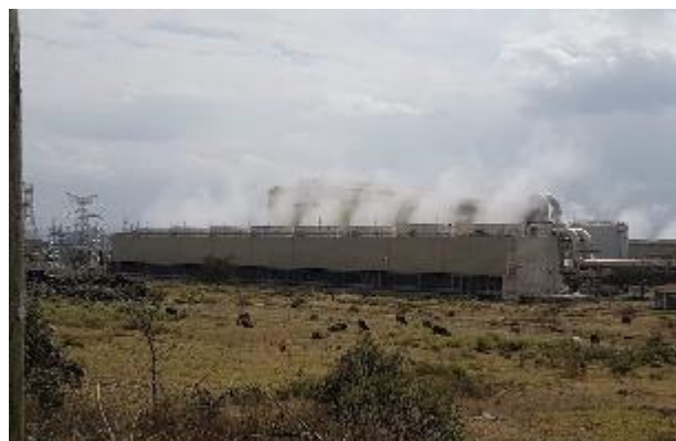
Olkaria V Geothermal Power Station